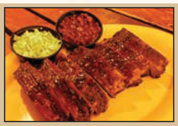
BABY BACK RIBS